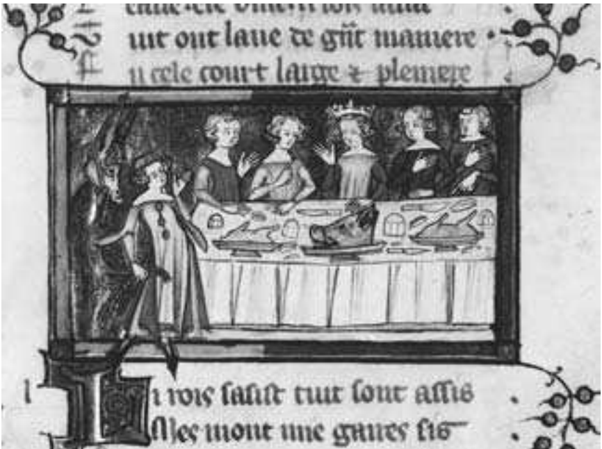
Boar's Head at Arthurian Feast, ca. 1340. From Cod. Vind. 2599, fol. 33r.

partridge, swan, pheasant, stork, heron, and many others. The section concludes with stuffed suckling pig. 81 With his next group of recipes Taillevent parallels the progression of an actual French feast, in which the roasts of the second course, le second mets , would have been followed by the entremets , dishes that could be sweet or savory and whose primary function was to entertain. Gilded foods, roasted birds returned to their plumage, boars' heads with flames shooting from their mouths, and pies filled with live birds are some of the more spectacular entremets in French cookbooks. An interesting showpiece combining two animals, a cock and a piglet, is called Cogz heaumez , or "Helmeted Cocks." To prepare them, piglets and poultry are roasted, the latter then stuffed, glazed with an egg batter, and seated on the piglets. As a finishing touch, the cocks or hens are equipped with paper helmets and lances. 82 While most of this preparation is still edible, the trend in the fifteenth century, as was shown earlier, was toward more and more complex constructions, often made of wood,